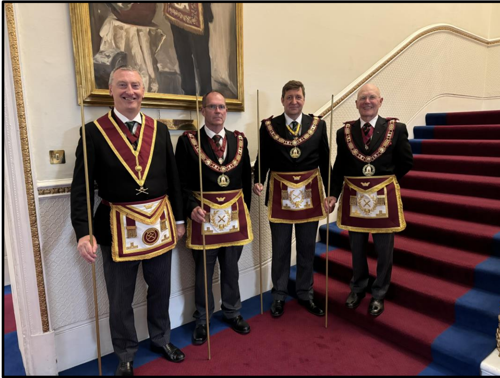
The MW Grand Master, the Grand Marshal, and the Grand Master of The Masonic Order of Athelstan in Australia and its Territories.